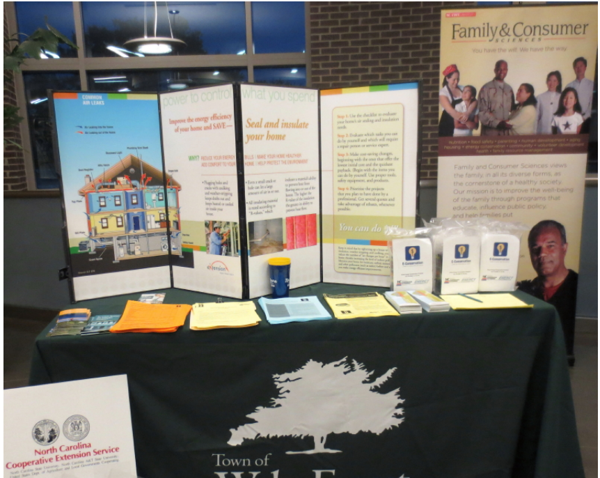
Presented Energy Conservation workshops in partnership with Local Chambers, Economic Development, Public Power Week & NCSU