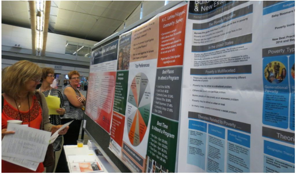
Won NCSU Graduate scholarship to present ‘Generational, Situational and Working with Families in Poverty’ at the 2013 National Joint Council on Extension Professionals Galaxy Conference