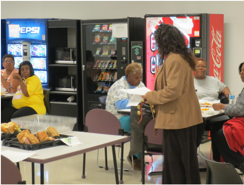
Facilitated Financial & Stress Management During the Holidays for Local Manufacturers