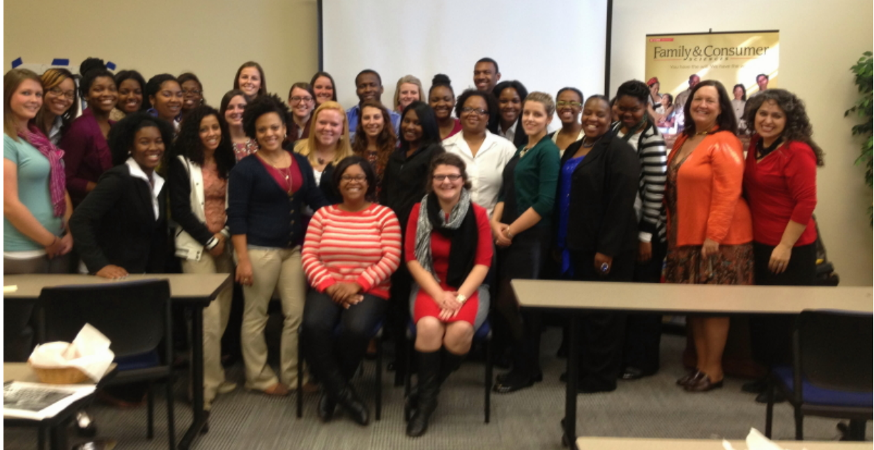
Served as the Keynote Speaker for North Carolina Family & Consumer Sciences Students at their fall conference in Greensboro