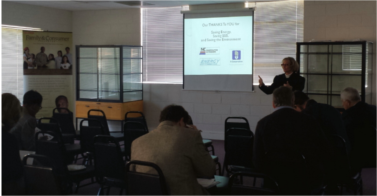
Presented Energy Conservation workshops in partnership with Local Chambers, Economic Development, Public Power Week & NCSU