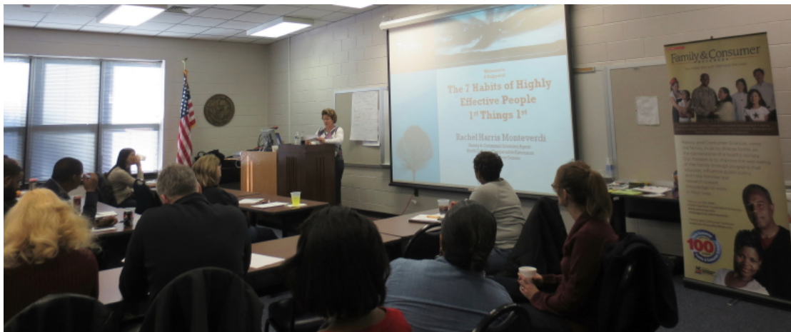
Facilitated Seven Habits of Highly Effective People professional development session for Franklin County Schools Nurses, Counselors and Social Workers