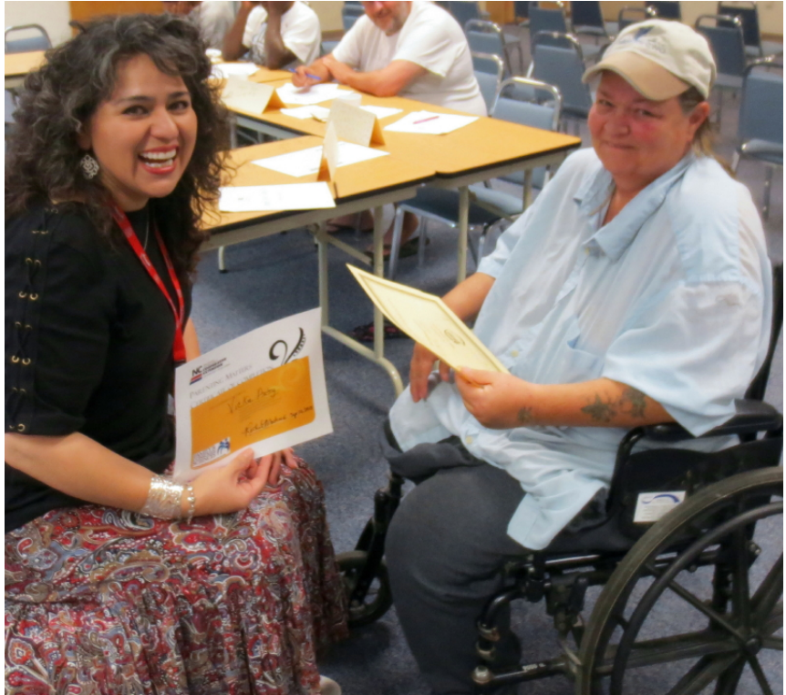
Parenting Matters participants graduate every 12 weeks; an online version is being developed.