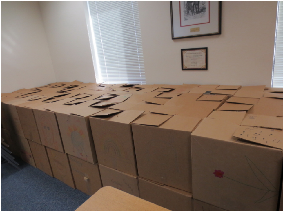
Secured thousands of dollars in food and other donations for Franklin County Families in need & for the Franklin County Family Safety Night