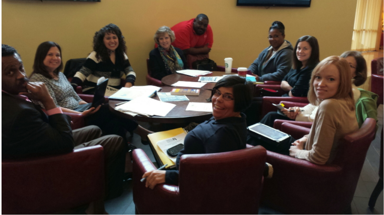
Chaired Statewide Planning Session for Family & Consumer Sciences Conference - members from NCA&TSU, NCCU, ECU, Meredith, DPI, and more